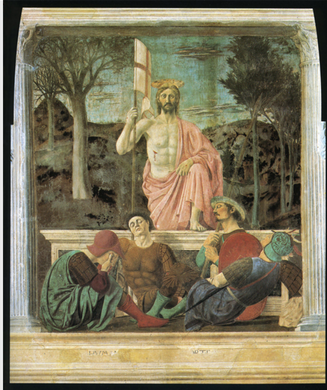
The Resurrection by Piero della Francesca

When they had heard the king, they set out; and there, ahead of them, marched the Star of Bethlehem, until it stopped over the place where the child was. When they saw the star, they were overwhelmed with joy. - Matthew (2:9-10)